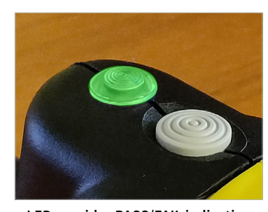
LED provides PASS/FAIL indication on the probe for fast verification of connector status.