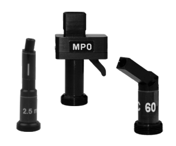
Backwards compatible, Interchangeable adapter tips provide inspection of many different connector types.